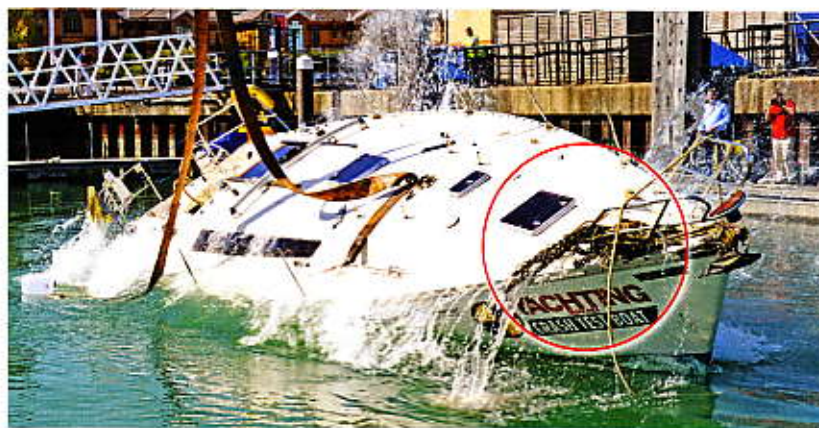
RIGHT: The chain broke through the anchor locker but the anchor, tied in place, stayed put