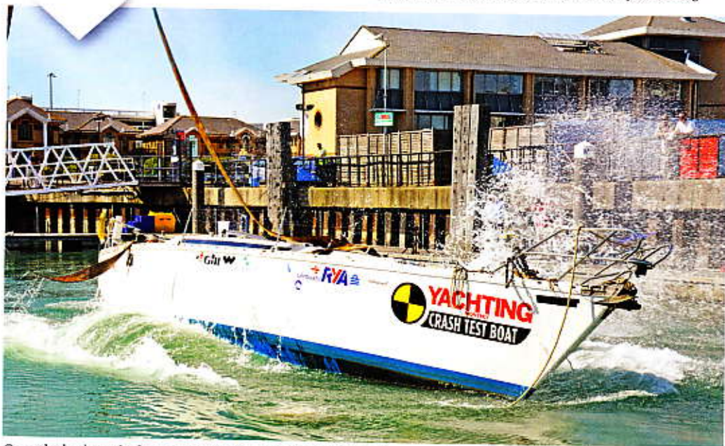
Once the keel reached around 40° from vertical, gravity took over and she slammed down dramatically

Having taken up the slack and extended the crane's boom to haul the Crash Boat 30ft clear of the pontoon, and with two Crash Boat crew loosely holding onto the bow and stern lines, the crane began to lift. Soon crashes could be heard from inside the boat.