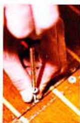
Sole boards are screwed down to keep them in situ

to do was screw them down again. It's neither an elegant nor a particularly convenient way to secure the boards – fitting them with finger-operated latches would be much better. Another possible solution that emerged was to fit eyebolts beneath each board and run a line through them, secured in the engine bay perhaps. I'm sure you can think of others.