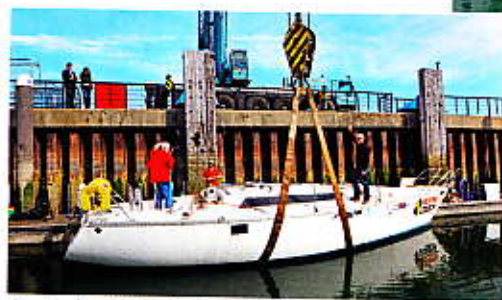
Ready for testing in Ocean Village Marina

Very few people have experience of how to deliberately capsize a yacht – it's not a skill for which