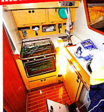
Only its gas pipe prevented the stove from flying across the cabin