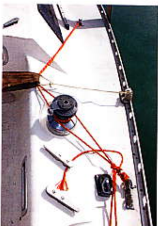
Flimsy-looking strop attachments were lashed between chainplates

available for the capsize, provided there was zero pollution. In our first meeting, Mike told us we would need to empty its oil and seal the engine, likewise the fuel tank, and remove anything that didn't float. He also recommended that we check whether the engine had captive bolts. Without them, the engine could leave its mountings and tear out the stern tube, or drop through the cockpit and into the marina. It would need to be secured in place somehow.