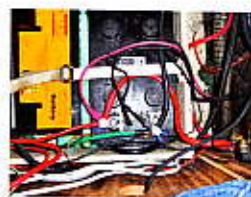
Battery straps contain these 'lethal missiles'

The Crash Boat has three batteries, two big domestic batteries and a smaller cranking battery. All were securely strapped but only the latter was sealed so to ensure zero pollution, we removed the domestic batteries. Both were on the pontoon so we could run the bilge pump when needed.