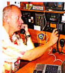
Knowledge is power, always get a forecast

■ Gather forecasts. In 1979, forecasting was an even more inexact science than it is today so none of the competitors would have had any idea what awaited them until it was unavoidable. Nor was the fitting of a VHF radio compulsory. A few with Long-Wave sets picked up broadcasts by Radio 4 and Météo France but again, not until a few hours before the storm struck.