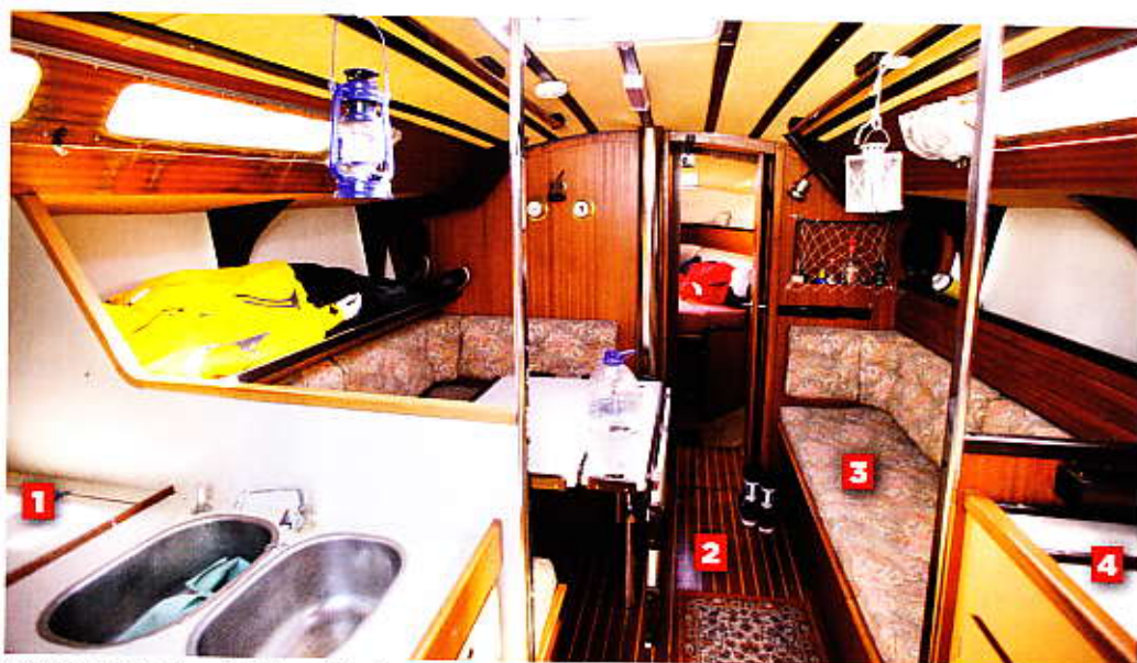
After 20 minutes in a DIY store, I had everything I needed to make the saloon a safer place in the event of capsizing