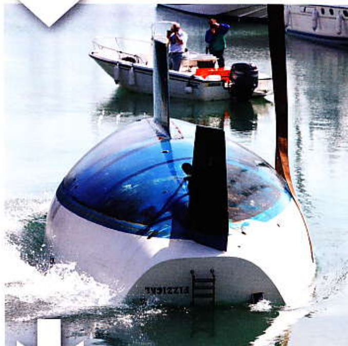
Once past her AVS, she stayed inverted very happily