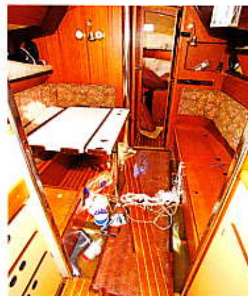
Heavy sole boards in flight would certainly have injured any crew below