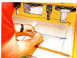
String, net and a bolt keep plates, fridge contents and stove in place

Without a cover, brackets screwed into the stove well, just above the gimbals, should keep it in place. The coolbox lid removed completely so we fastened that with string looped over two screws, another hasty but hopefully effective solution.