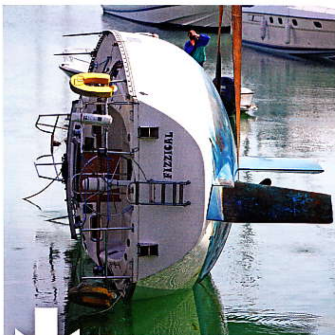
The crashing below belied the serenity of the roll

The sole boards were not awash but there was clearly a lot of water in the boat. The contents of the saloon seating lockers – the toolbag, flares and the file containing the ship's papers – were submerged. The chart table's bin lockers and shelves were brimful too. Only one galley locker had opened from which a plastic spoon escaped and wedged itself under a hand-hold. The saloon cushions had assembled themselves neatly in the starboard pilotberth but apart from that, she seemed in fairly good shape for a boat that had just gone through what she had.