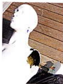
All our dummies were damaged in the test

Secured by a lee cloth, you would have nothing more threatening than a cushion to deal with. The amount of flooding would be extremely alarming but with bilges free of detritus you would be better able to deal with it.