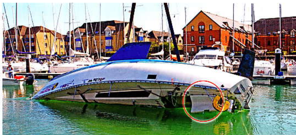
ABOVE: With no lock, the starboard cockpit locker falls open and scoops a tonne of water

How effective can a few simple changes be? See p22