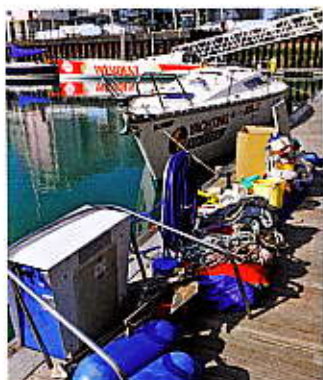
Much of her gear was stripped out for the test to prevent pollution

strops would have torn out those and the stanchions.