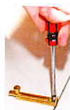
A bolt keeps the chart table closed

Home to dividers, batteries, mobile phones, batteries, spectacles, and more, the chart table had to stay shut. We used a sliding bolt latch again. We should have placed netting across the bookshelf too and secured the locker beneath the navigator's feet.