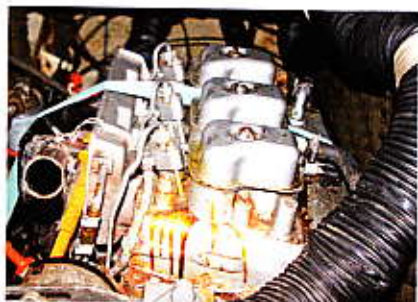
A ratchet strap prevents the engine escaping

As the engine did not have captive bolts, we had to secure it in place with a ratchet strap to ensure it didn't leave its mounts. Our capsizing had to result in zero pollution so the engine oil was drained and the dipstick/oil filler and crankcase breather sealed. After that, all we needed to do was to clean up the mixture of oil, diesel and water sloshing around in the engine bay.