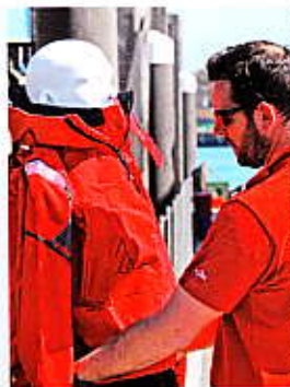
Harry gets dressed for his berth in the forepeak

To illustrate what would happen to crew down below during a capsize, we bought three mannequins, named Tom, Dick and Harry, and stood one in the galley, laid another in a pilot berth and a third in the forepeak, supposedly out of harm's way.