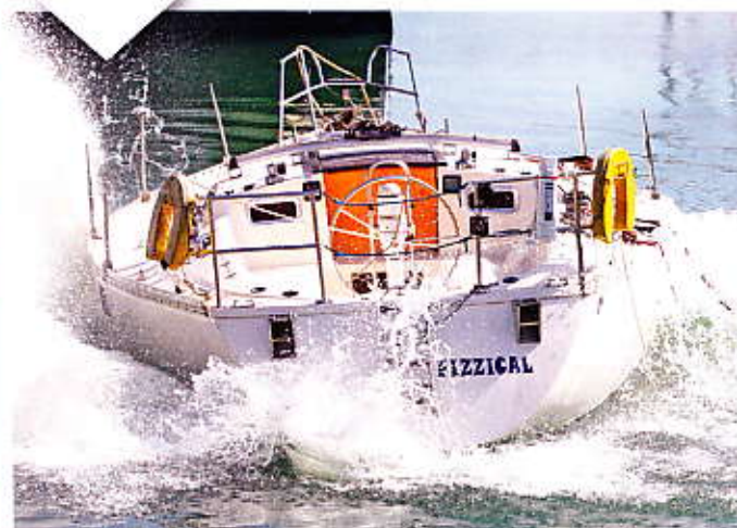
In our test, only the last 60° of the roll caught the real brutality of capsize