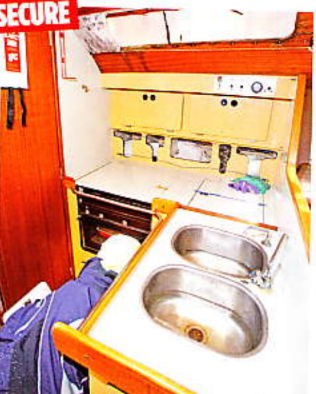
The contrast is clear. A dishcloth and a broken plate are the only casualties of the secure roll