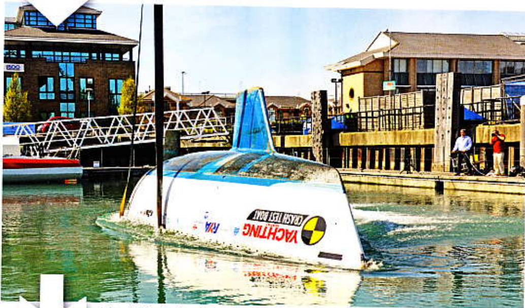
Film shot inside the saloon shows water flooding through vents and the companionway