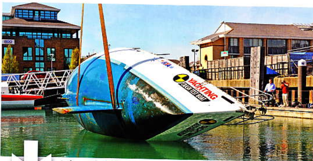
As the crane hauled her over, ominous crashes hinted at the imminent chaos within