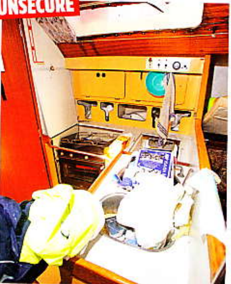
Only the gas pipe held the stove in place, all else is destroyed, dislodged or disgorged. Terrifying