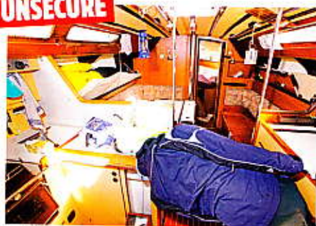
Sole boards, table leaves, charts, chargers, flares and cans littered the saloon. Complete disorder