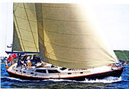
If your sailing plans can't avoid storms, make sure your boat is up to the job, like this Rustler

■ Storm tactics. Yachts are most vulnerable to capsize when beam-on to large waves so a correctly deployed sea anchor will ensure your safety. In sailing terms, tactics employed during the 1998 Sydney-Hobart Race demonstrated that extreme seas are best taken head-on with your best